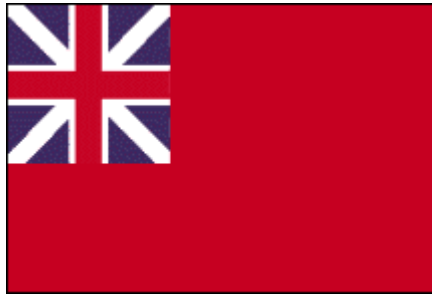
The "Red Duster"

The M.V. ROSCOE flew the British Merchant Navy flag on her stern when in port and this can be seen in the above photograph of the ship. This flag has been known for years as the "Red Duster". This was the flag flown by the British North American ships, the many wooden vessels built in Canada during the 1800's and until Canada adopted this red ensign as the national flag with the Canadian coat of arms on the fly. The exception is if a certain number of the officers in a British merchant ship hold rank in the Royal Naval Reserve they can fly the blue ensign.